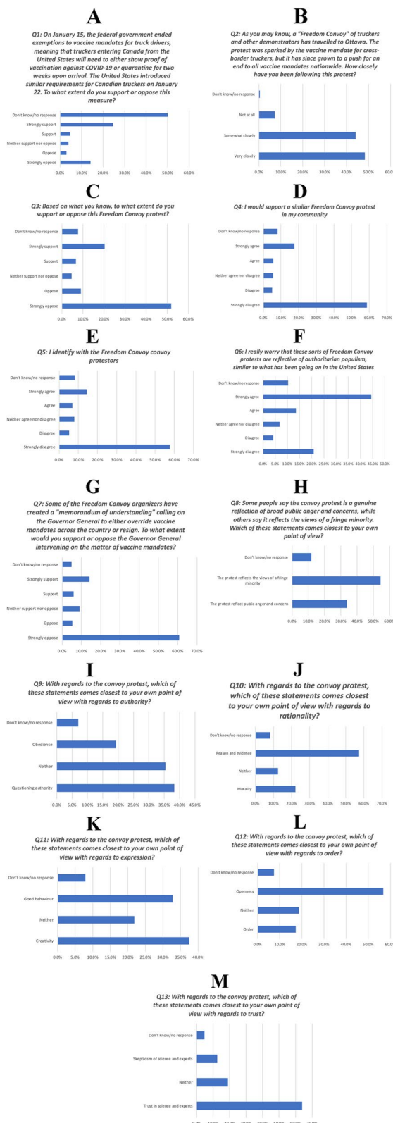
Fig. 3 Bar plots for Freedom Convoy questions