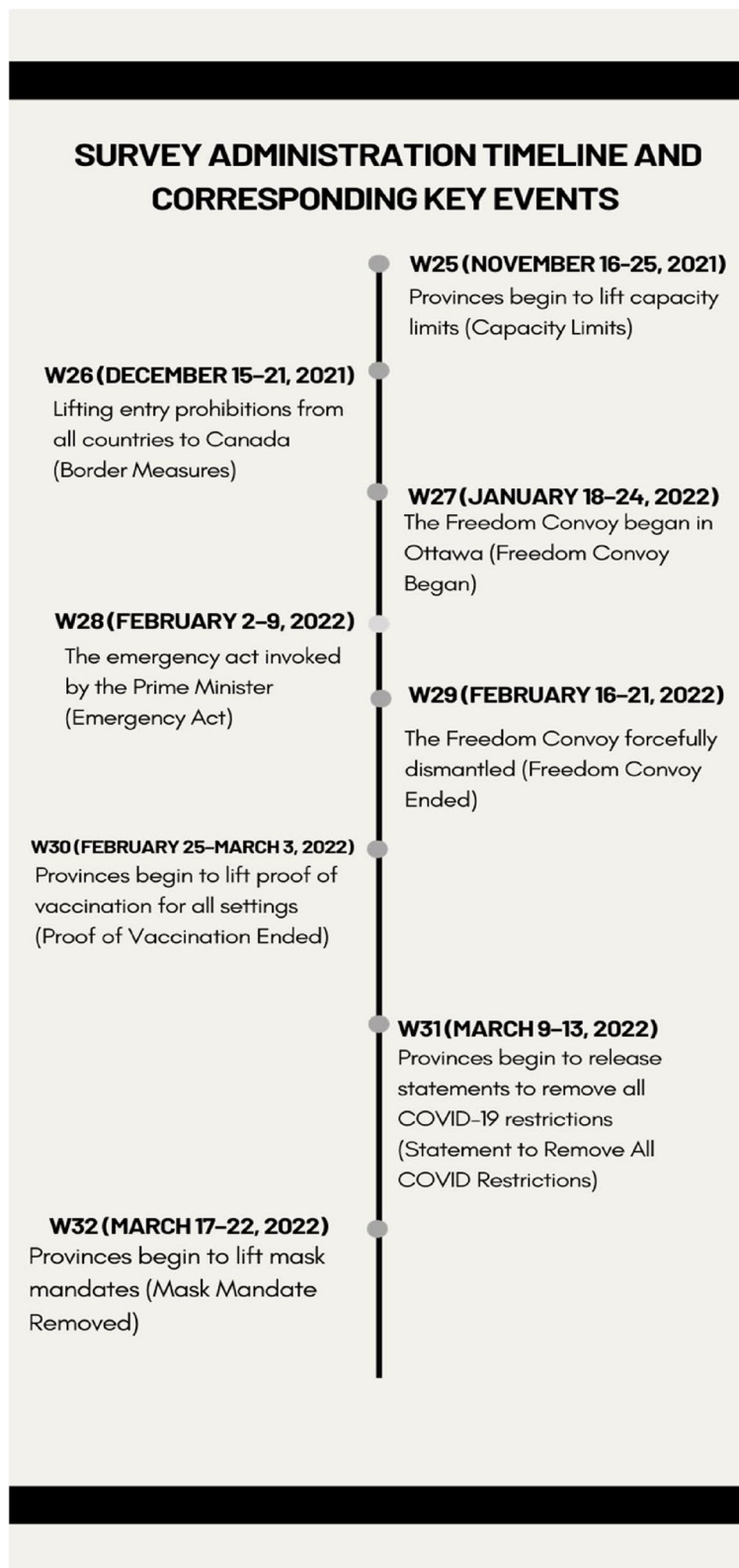
Fig. 2 Timeline of survey administration and coinciding key social events