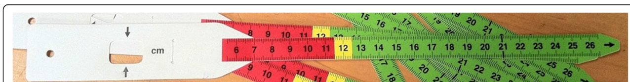
Figure 1 MUAC tape ($0.06, UNICEF supply catalogue) showing 3 classes: red, yellow and green.

The planned study method had involved going from home to home, and performing a 5 minutes training session for each mother; however this proved impossible. In both villages, once the objective of showing mothers how to perform MUAC classifications had been explained to the village chief and other leaders, it was considered to be so important that they insisted on calling an immediate meeting of the villagers. Mothers and children formed a seated group around the investigators, circled by the older girls who stood to obtain a good view, with the men and boys standing behind. Each mother did one MUAC measurement on the left arm, followed directly by one MUAC measurement on the right arm of their child. The mother called out the colour classification (eg "Red") and this was noted down by the investigator. This was then repeated by an experienced CHW testing the right and then the left arm of