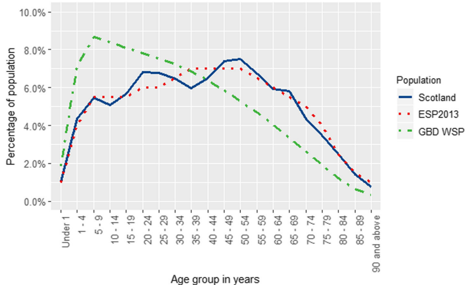
Fig. 1 Age distribution of Standard Populations and the 2014–16 Scottish population. ‘Scotland’ refers to the three-year annual average of 2014–16 mid-year national estimates; ‘ESP2013’ denotes the 2013 European Standard Population; ‘GBD WSP’ denotes the Global Burden of Disease 2017 World Standard Population

Ischaemic heart disease was the leading cause of DALYs for both crude rates of DALYs and rates standardised using ESP2013 (Fig. 2). The ranking of causes of disease/injury by DALYs were very similar when ranked by crude rates or ESP2013 age-standardised rates. Within the leading 10 causes, tracheal, bronchus and lung cancer and migraine slightly dropped in ranking when based on ESP2013 age-standardised rates compared to crude rates. Cerebrovascular disease and